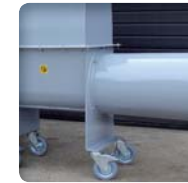
▶ Handling wheels for mobility of the equipment (optional)