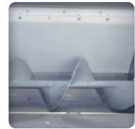
▶ Compacting screw