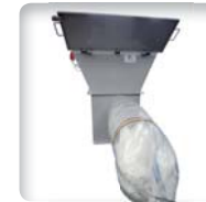
▶ 100 % hermetic containment sheath , clean working environment and possibility to recover residual fines by specific tray