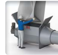
▶ Ergonomic access door for the operator